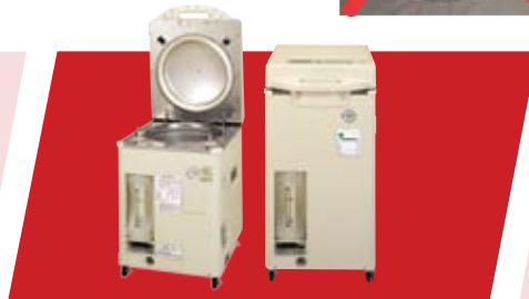
MLS-3751L & MLS-3781L